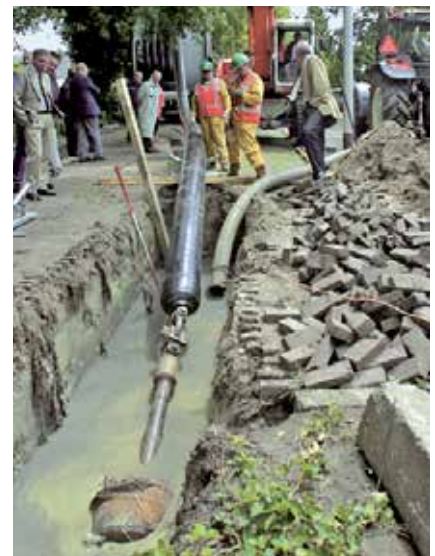
Laying the FLEXWELL FHK by using the horizontal directional drilling method.

This minimal cover requirement is a great advantage when installing new pipes on top of existing concrete trenches (retro-fitting).